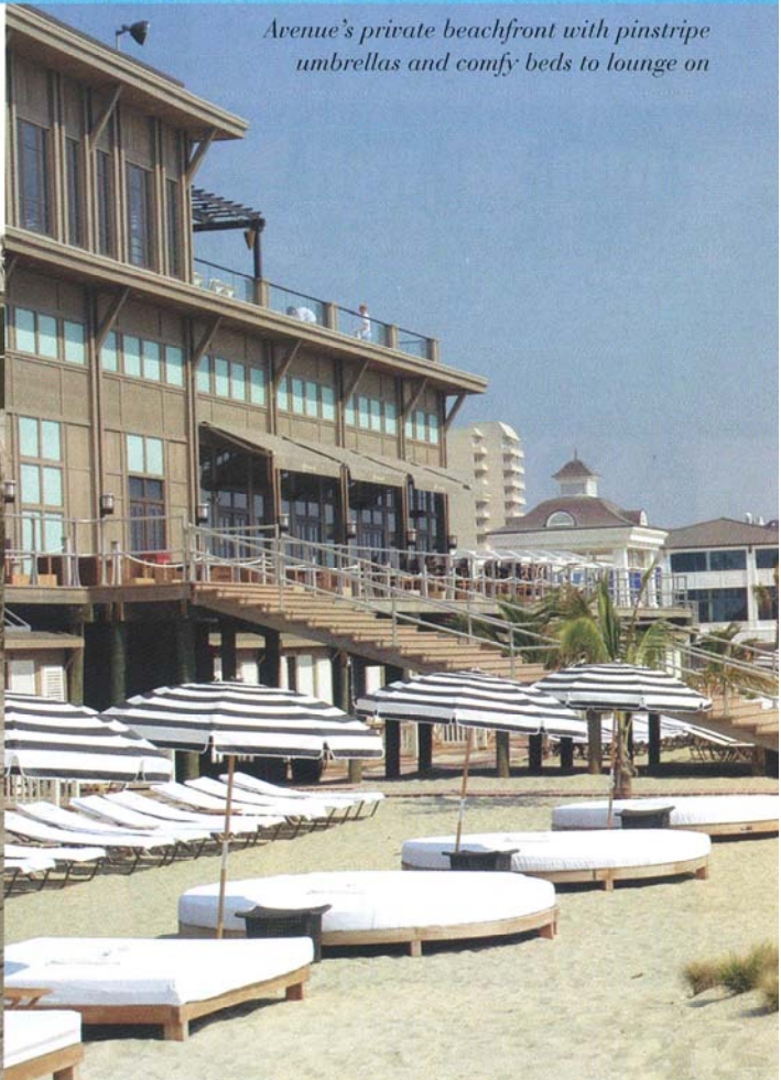
Avenue's private beachfront with pinstripe umbrellas and comfy beds to lounge on