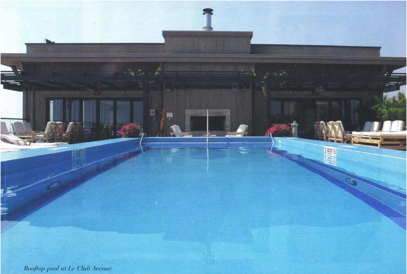
Rooftop pool at Le Club Avenue