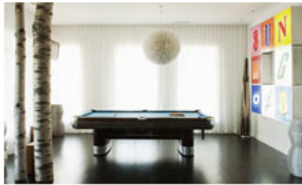
Suburban chic... Bungalow Hotel is a match for Manhattan.

We New Yorkers can be guilty of stereotyped views of New Jersey (which viewers of shows such as The Sopranos may recognise). A night out on the Jersey Shore has, traditionally, been as appealing as a flock of spiky-haired dudes, doused in cologne and shouting about their "sick" cars and wrestling meets. This is obviously a snobbish perception, but ask any New Yorker about the "bridge and tunnel" set (so called due to their entry routes to the city) and you'll likely get a similar description.